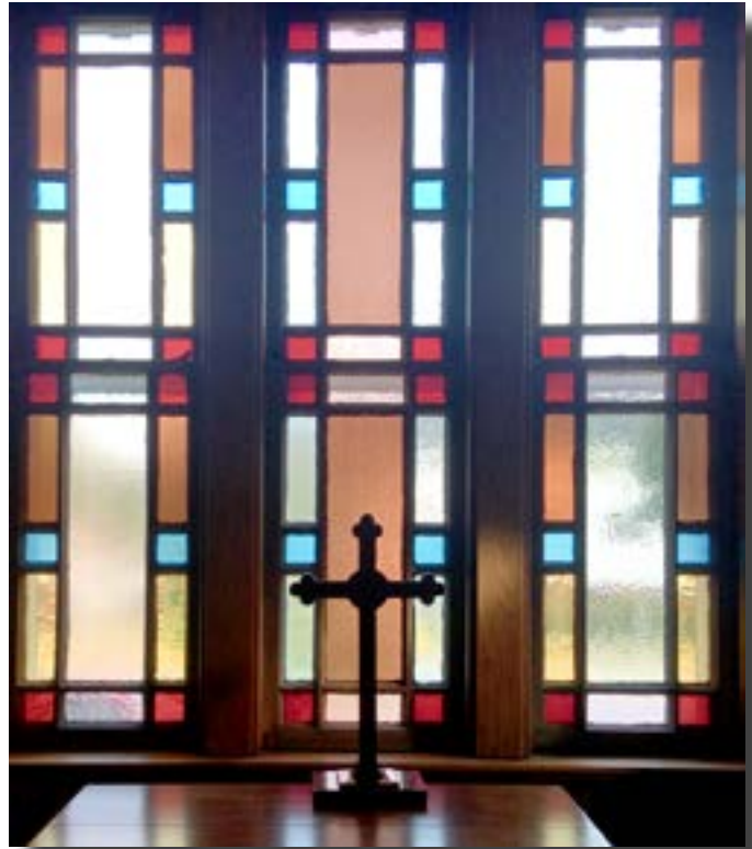
Stained glass windows in CEC's narthex