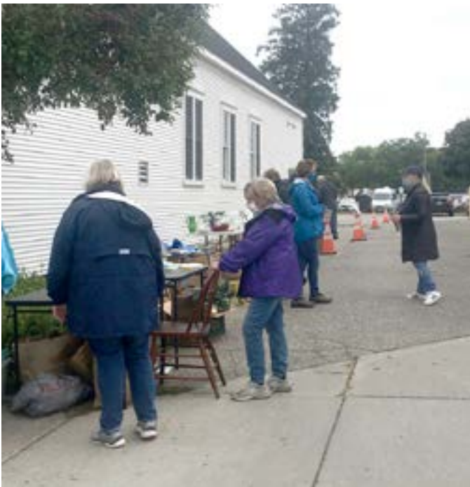
Shoppers look over formerly loved items during the rummage sale benefiting ECW

All the weeks of sorting and marking were behind us and the tables of glassware, bedding, toys, and clothing were ready for customers. But as we gathered to host the church rummage sale, we all asked in one way or another, "Was all this work worth it?"