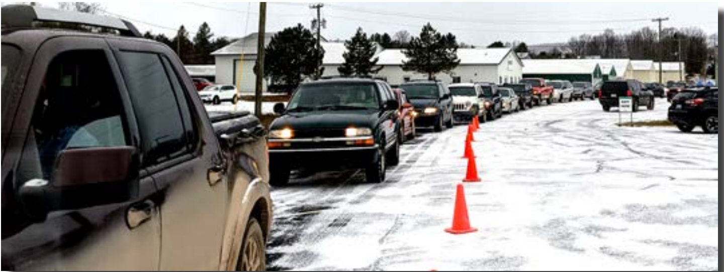
Manna Drive – Thru Food Pantry