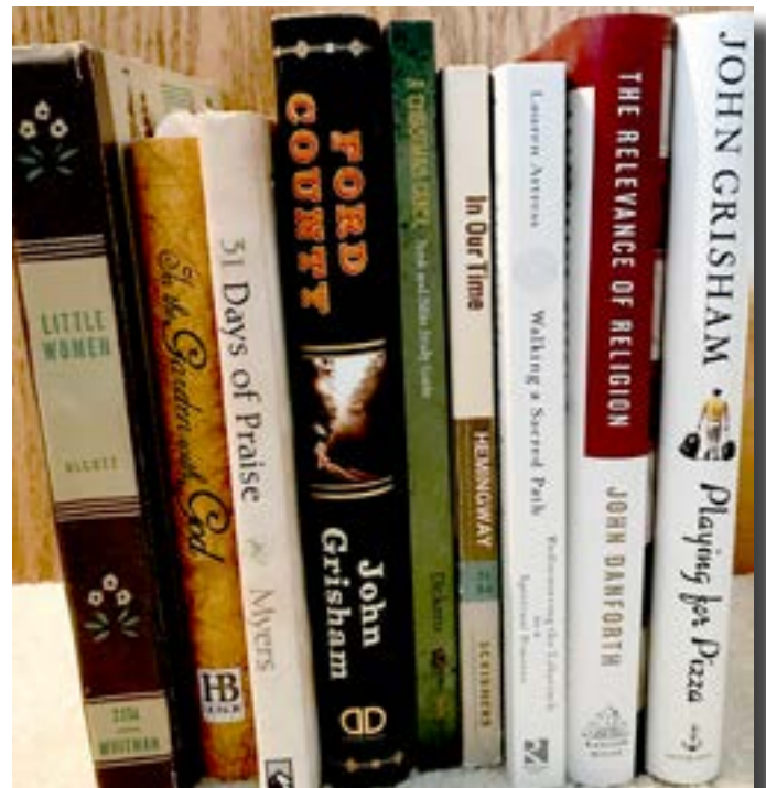
Books, Books and More Books!