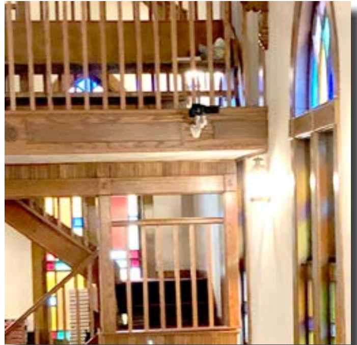
Video camera installed for live streaming church services

Live stream and audio equipment has been permanently installed at Christ Church thanks to the Taylor Series. You will notice the camera mounted under the balcony and a speaker mounted in the center of the sanctuary. We believe you'll notice the crisp and clear sound from the audio equipment. Both of these tools add to our worship in ways unimagined before the pandemic. Again, live streaming services can be enjoyed on the church website or YouTube.