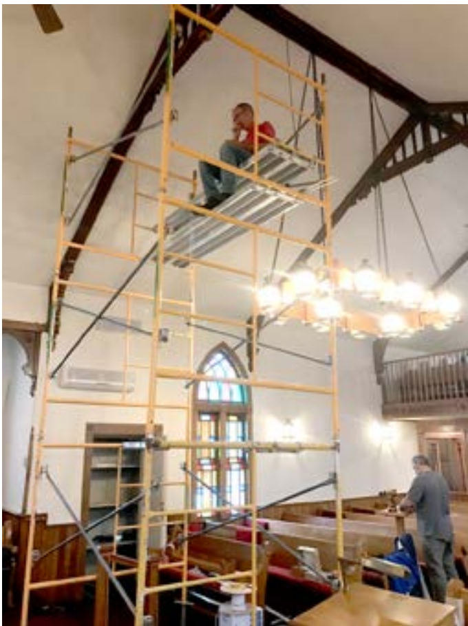
Technician from Buday Sound Advice installing audio equipment at CEC

Shame corrodes the very part of us that believes we are capable of change. – Brené Brown