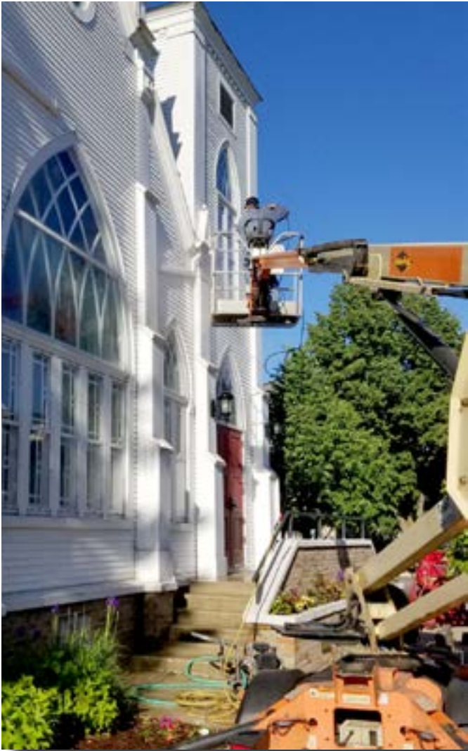
Power washing exterior of church

gets a fresh start to the summer season!