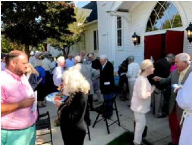
Great outdoor gathering for wrap up Stewardship Sunday.