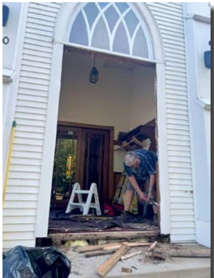
Preparing the opening for our new doors. This work should take about one week.