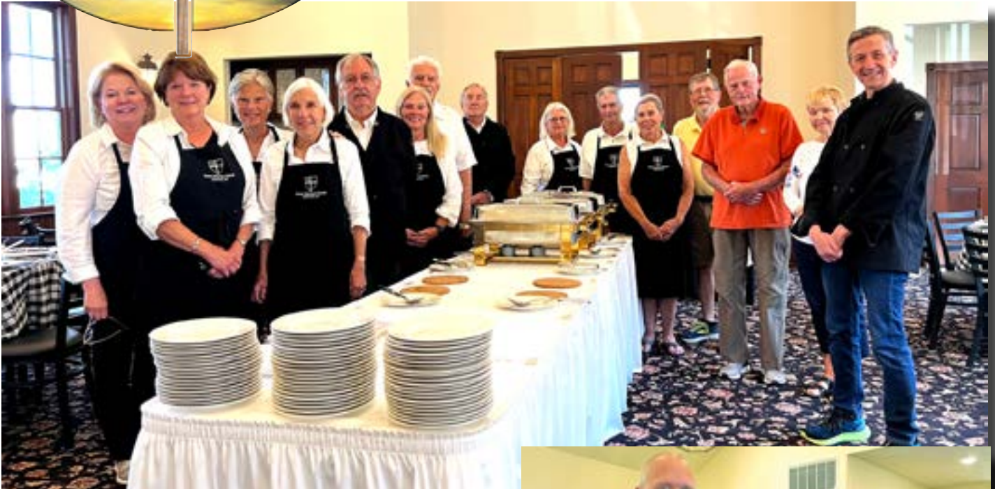
Christ Church parishioners volunteer to serve the First Responders of Charlevoix County