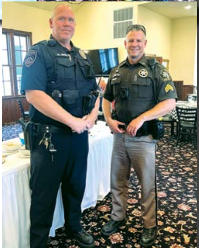
Charlevoix Police Officer and Charlevoix Sheriff officer attend the First Responders Dinner on September 5, 2023 Sponsored by Taylor Series

– Sincerely, Charlevoix City Police Department