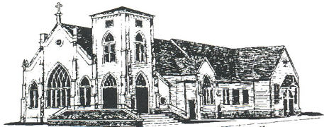
Corner of Clinton and State Streets