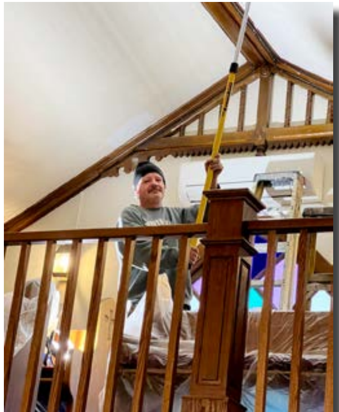
Painters repair the damage to the balcony ceiling. The fresh paint around the inside of the church is clean and fresh. A big thank you to our donor for the repairs around the entire church.