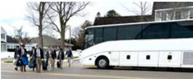
Two executive buses brought the Glee Club to Charlevoix