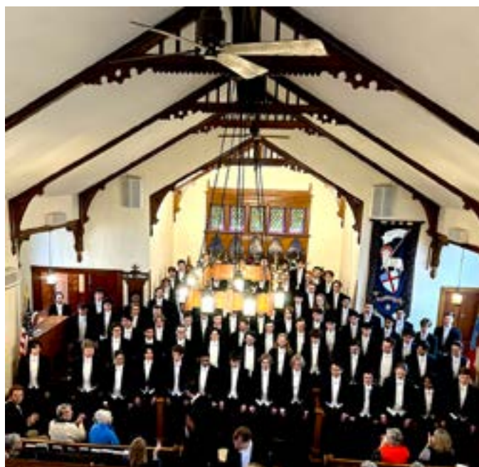
All 95 Glee Club Members performed in our sanctuary