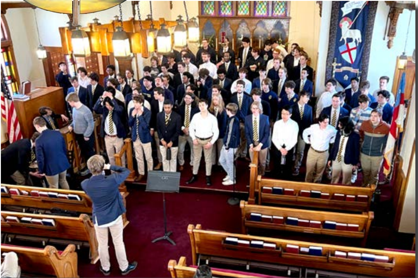
Glee club members practiced before the 4p.m. concert