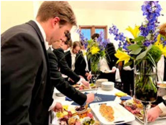
Glee Club enjoys reception after their Taylor Series presentation. It was AMAZING!