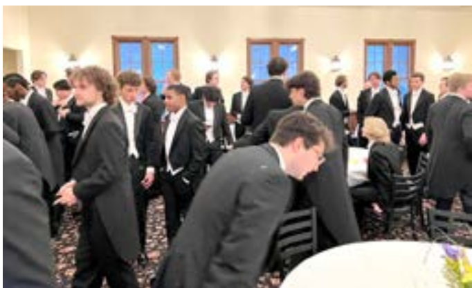
University of Michigan Glee Club gather in CEC parish hall following their fabulous concert. Almost 125 community members attended the great afternoon provided by the Taylor Series.