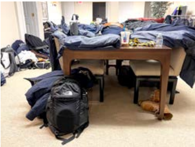
We converted our undercroft into a dressing room for the Glee Club. Looks like a dorm room...right. Haha!