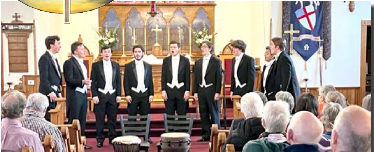
University of Michigan Friars entertained guests during intermission