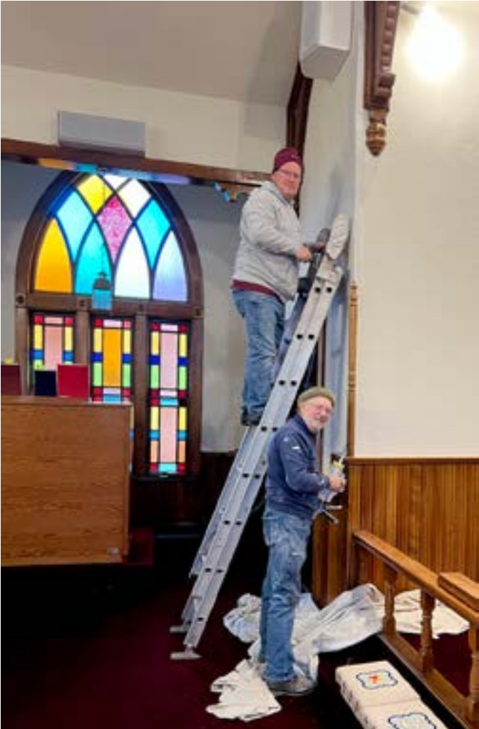
Painters continue to work at CEC