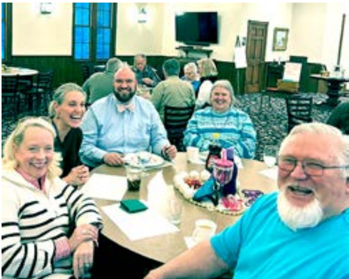
A fun group gathered for pancakes

We had a joyful gathering for our Shrove Tuesday pancake supper held on February 13, 2024. Approximately 30 people enjoyed pancakes, sausages, blueberry sauce and paczkis. It was a wonderful evening.