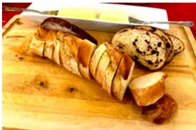
Various breads are served with Soup Suppers in Lent

A Compline service will begin at 5:15p.m. with dinner to follow. All are invited each Friday in Lent. Should you wish to bring any of the following items for dinner; soup, salad or bread, there is a signup sheet in the parish hall. It is a great way to enjoy fellowship with your brothers and sisters in Christ.