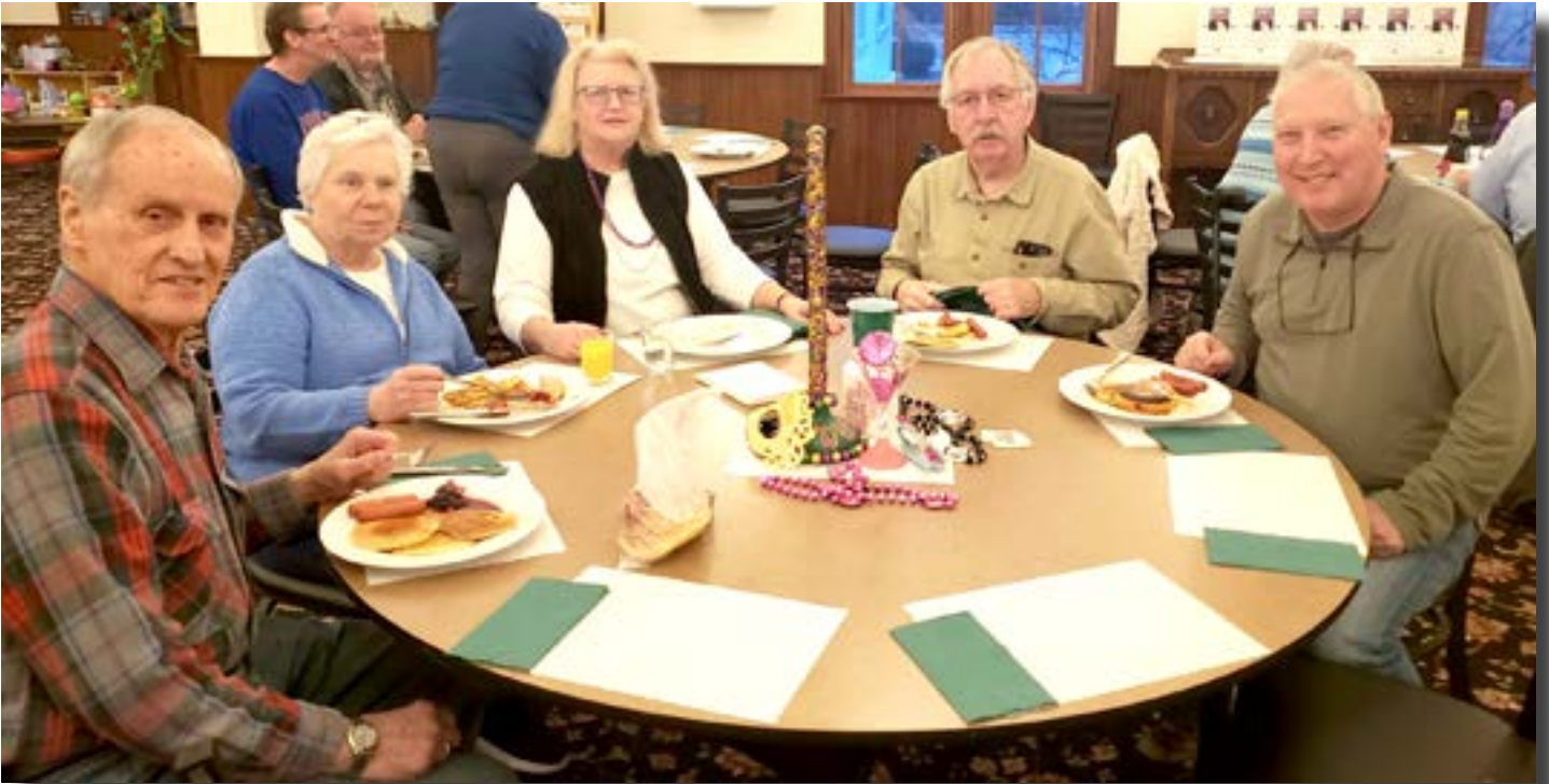
Pancakes for dinner...yum!